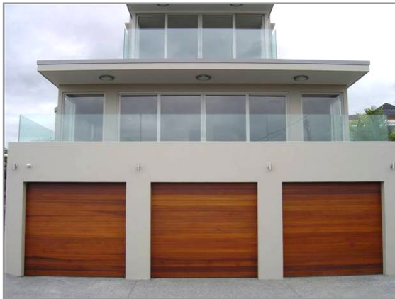
Ashton Horizontal HP83 Sectional Door